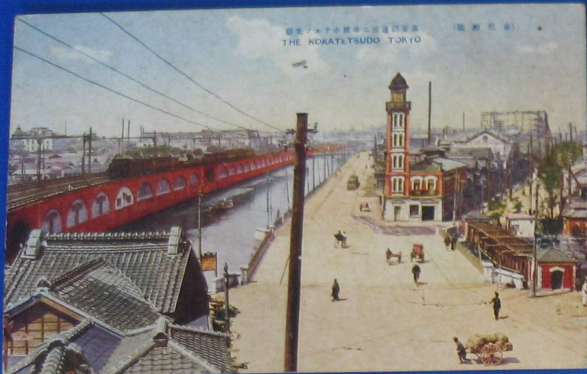
東京の神田橋 THE KOKATELSUDO TOKYO