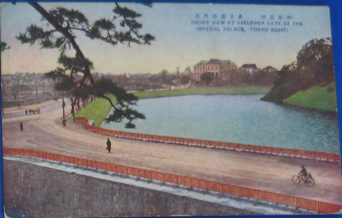
皇宮の櫻田門 FRONT VIEW AT SAKURADA GATE OF THE IMPERIAL PALACE (TOKYO SIGHT)